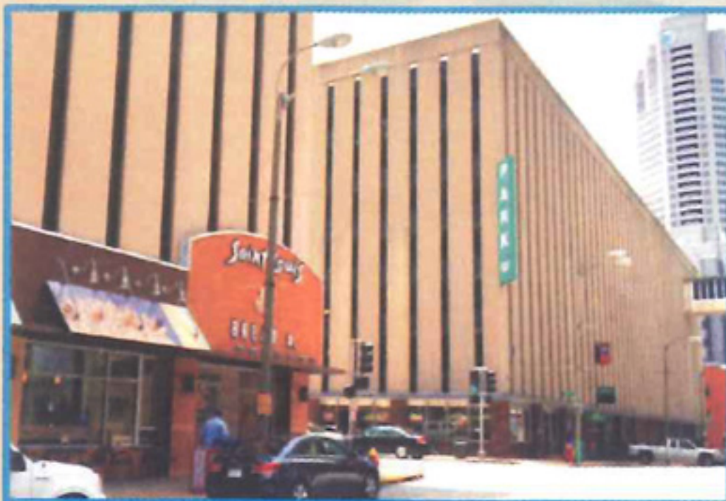
Kiener Parking Garage West Enter from Pine or 7th Streets