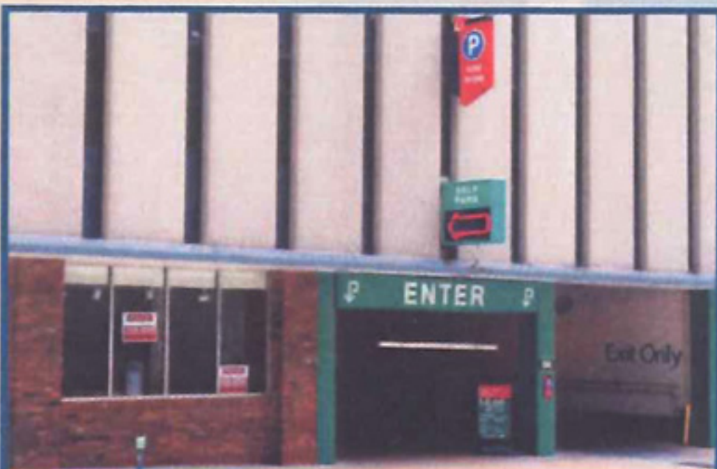
Kiener Parking Garage East Enter from Pine Street