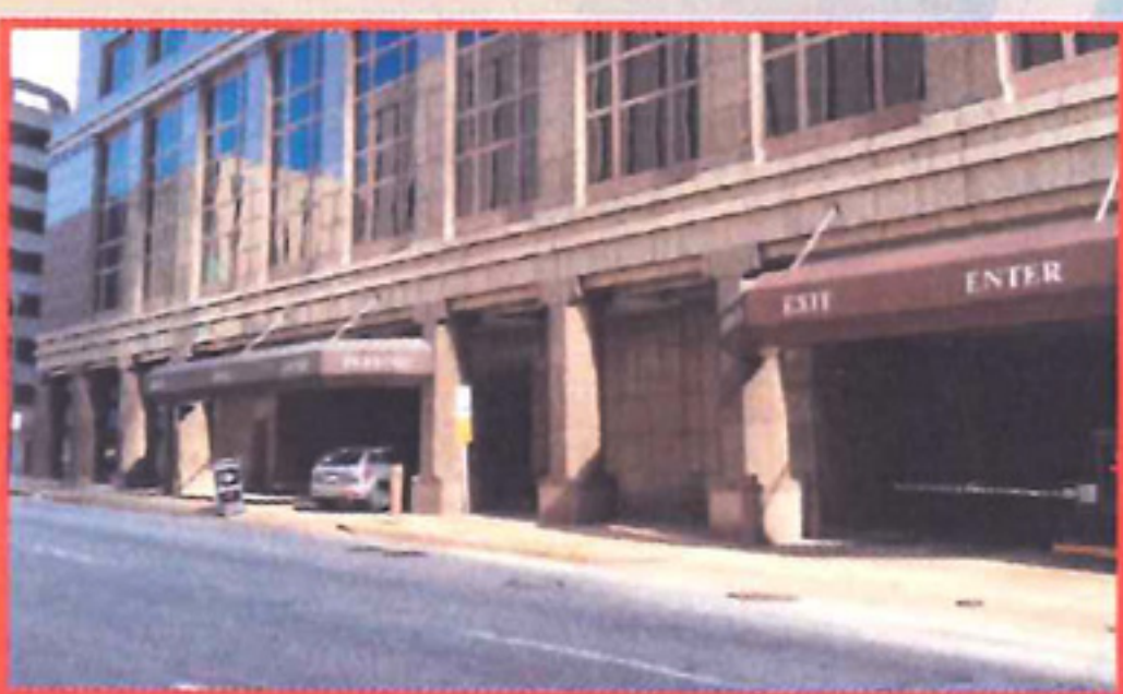
Met Square Building Parking Enter from Pine Street